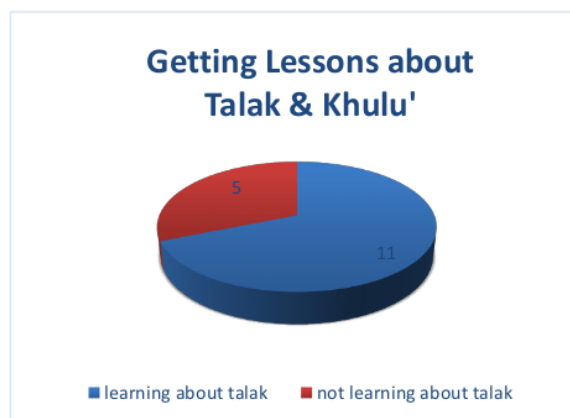
Figure 3: Distribution of participants receiving lesson about Talak & Khulu'

Based on the results of data analysis regarding whether the participants receive the materials about divorce, most of participants who take the course said that they receive lessons about talak and khulu' . A close look to the data reveals that 65% (n = 11) of them said that they received the materials but not deeply and 35% (n = 5) stated that said that they did not receive the materials about divorce at all (look at figure 3 for details).