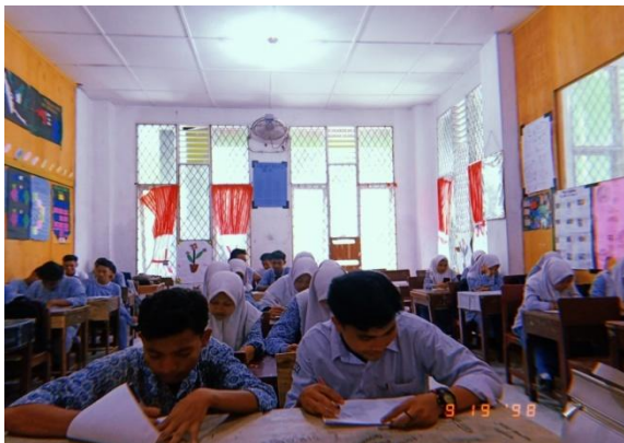
The students do test of reading