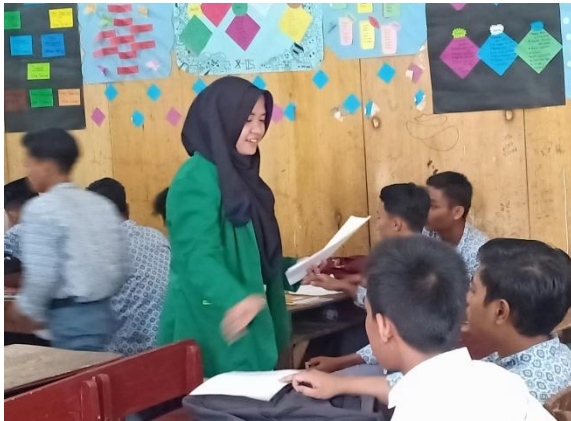
The researcher distributed the test for the students