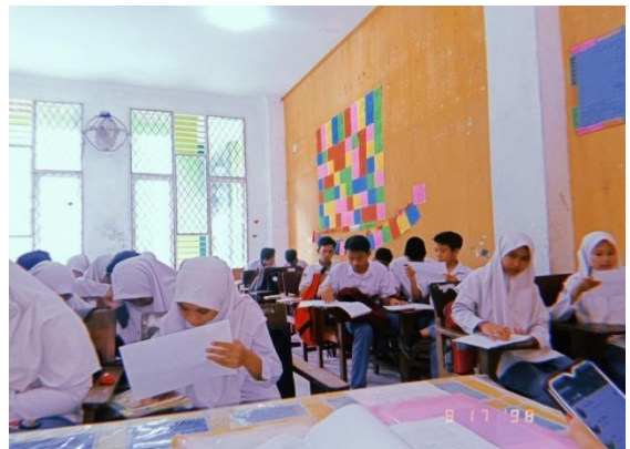
The students do test of reading