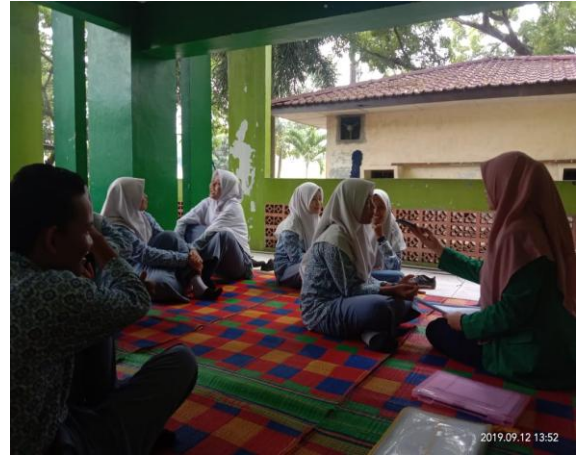
The researcher do interview with students after implementing the test