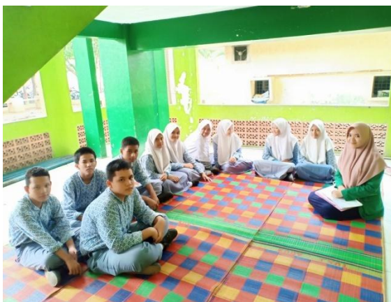
The students interview took a photo together with resercher