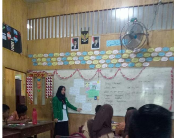
The researcher ask the students about their opinion about English