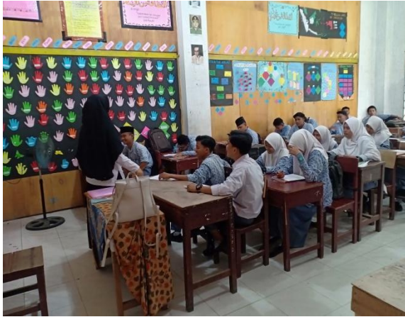
The students listen the instruction from the researcher