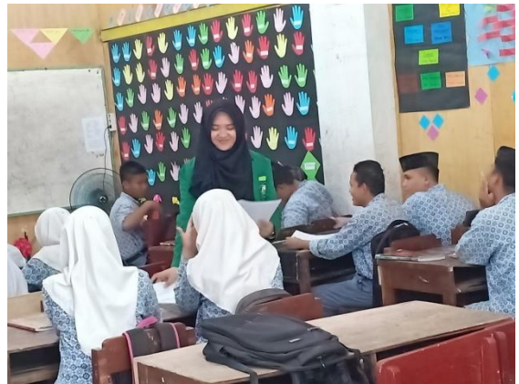
Some of students ask the researcher about the test of reading