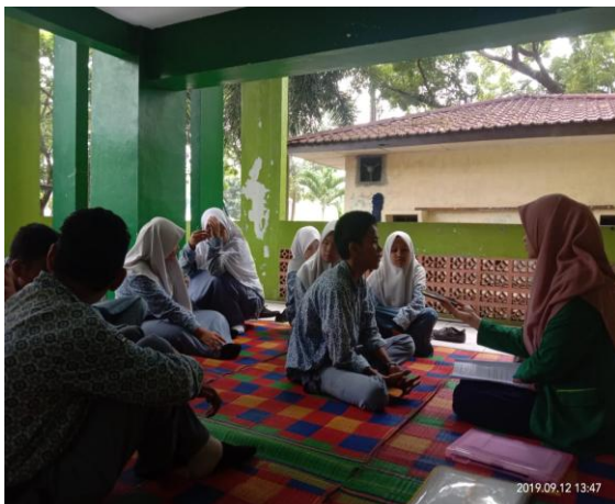
The researcher do interview with students after implementing the test