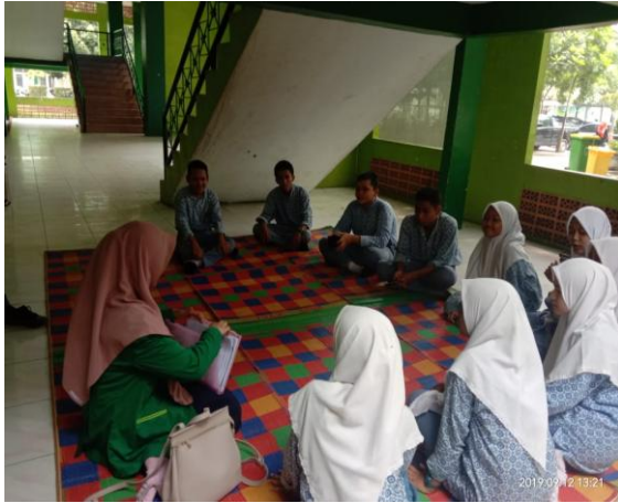
The students listen the instruction from the researcher to do interview