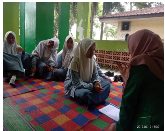
the researcher do interview with students afer implementing the test