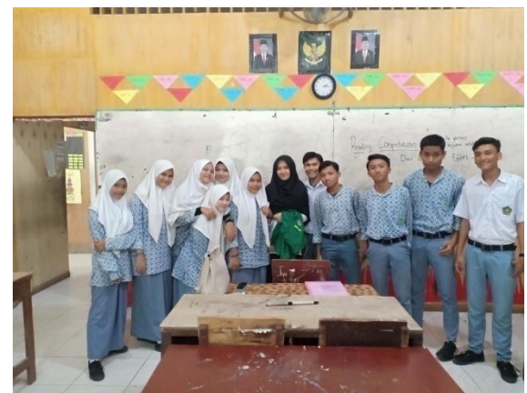
The students took a photo with researcher after finishing the test