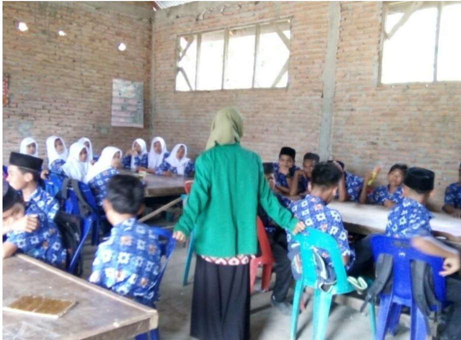
Giving the pre-test