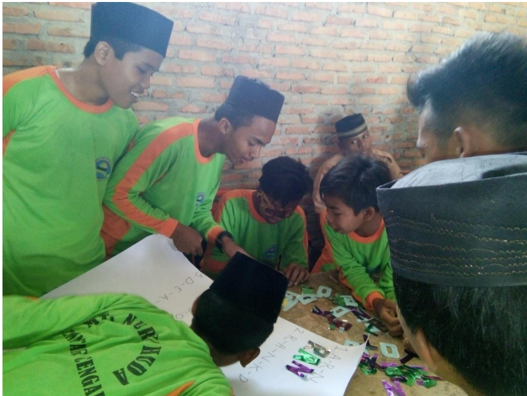
Giving the post-test I