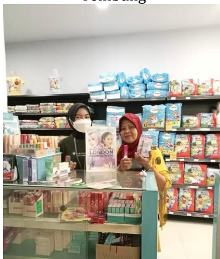
Image 3. Documentation with Wardah Customer at Irian Supermarket Medan Tembung

By employing these methods, Wardah can directly persuade buyers at Irian Supermarket Medan Tembung and increase sales of their products. Below is direct documentation with Wardah customers at Irian Supermarket Medan Tembung.