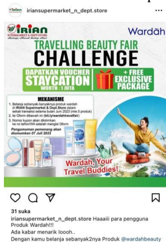
Figure 5. Events and Promotions on the Irian Supermarket Instagram Account