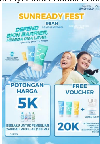
Image 2: Wardah Event Flyer and Product Promo at Irian Supermarket

Source: Flyer BA Wardah Irian Supermarket Medan Tembung