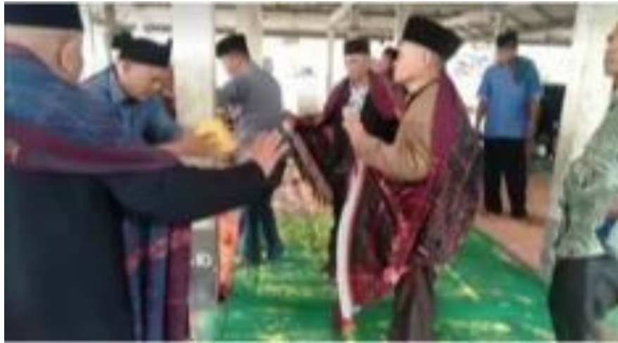
Figure 2. Tor-tor dance taken January 03, 2024

After the incident, Islam spread more and more in South Tapanuli, many have become Muslims, especially the people in Huraba Village, South Tapanuli Regency. The people of Huraba Village, mostly surnamed Sitompul, and the majority are Muslim and even religious, but they cannot eliminate the customs of their ancestors. They still uphold their customs, sometimes by holding massive Horja Parties with typical Toba Batak Tor-tor dances. They do Horja Aek to clean the rivers, clean the tomb of the King of Lekkun Dolok. When conducting Horja parties, they sometimes invite relatives surnamed Sitompul from various regions to enliven the Horja Party. (Pulungan & Falahi, 2018).