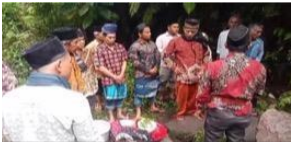
Figure 3. Patuaekkon (Cleaning the River) taken 2024

Before conducting the Horja Party, the people of Huraba Village first clean the rivers or streams originating for cleanliness together, but it is different from cleaning the river as usual, but using grated coconut, then the coconut water is separated and given brown sugar, then sprinkled on various river banks, this is the custom carried out by the people of Huraba Village, when conducting the Horja Party. The tradition will always be carried out, as a form of love and loyalty to customs.