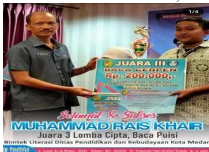
Figure 1. Documentation of Prize Presentation at Literacy Bimtek Activities

Although currently, the Al-Ulum School Library does not have special activities in its library, the school and library are able to improve the quality of education of students from other paths, such as recommending students in every literacy activity they have participated in, namely the creation and short story reading competition held by the Literacy Bimtek of the Medan City Education and Culture Office and won third place.