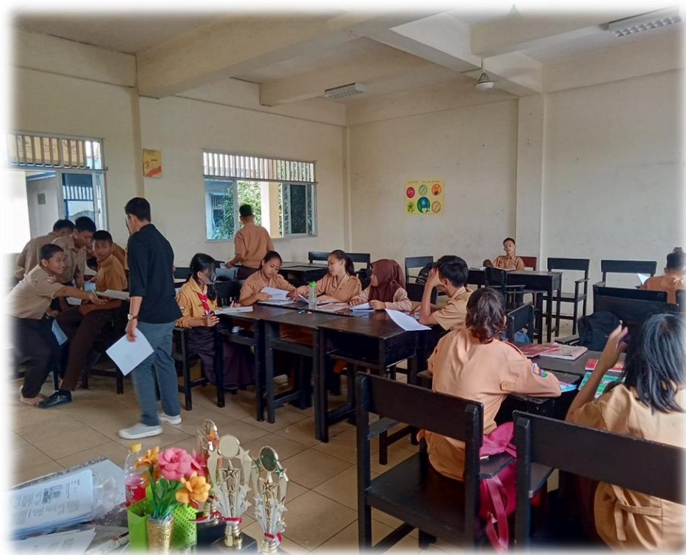
*Treatment session at control group without using Dictionary