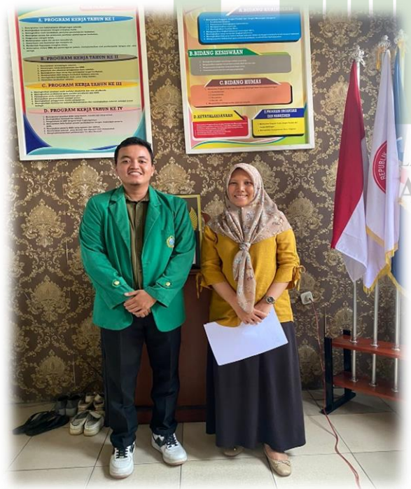
*With the English Teacher