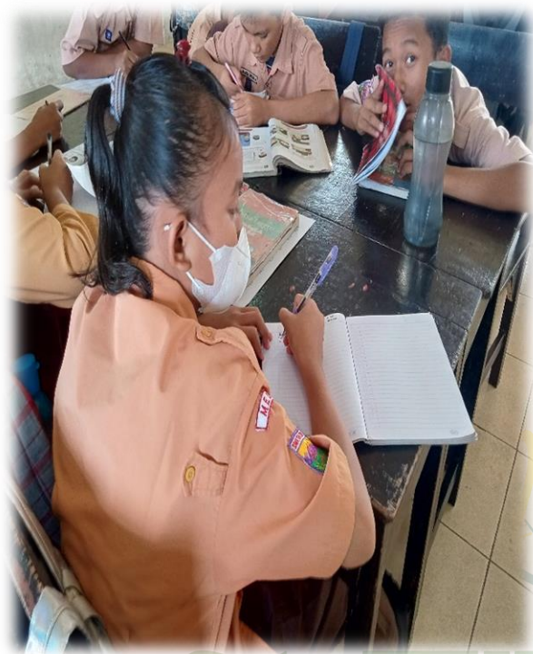
*Post-Test session after treatment by using dictionary