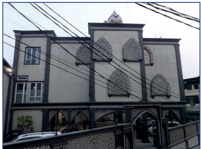
Figure 5: Mosque of the Shaykh Burhanuddin in Jakarta