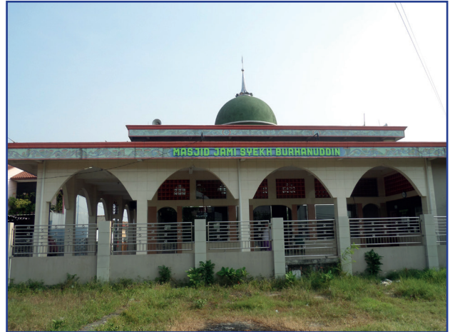
Figure 4: Mosque of the Shaykh Burhanuddin in Bekasi

This wandering tradition is always connected to TS, as part of an identity maintained and preserved in their areas of migration. In Indonesia, this community always attempts to build an ethnic-based environment and consider TS a part of their social identity. This means that TS is found in almost all parts of the country where these peoples have settled. As a foreign Pariaman's identity, a mosque is always observed and known as the Surau of Shaykh Burhanuddin (Figures 3, 4 & 5). This unequivocally shows a connection with the TS figures from Pariaman land. The distribution of this type of mosque has also become an ethnic identity because only this community has a connection with the big name. For people leaving away from their place of origin, maintenance of connection with the area of origin is very