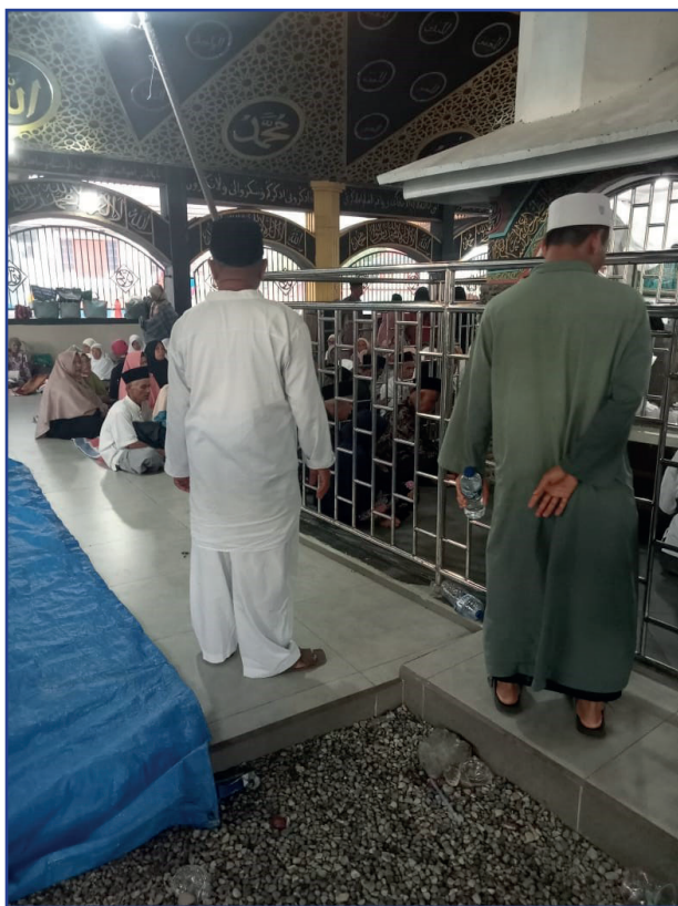
Figure 6: Basapa Ritual