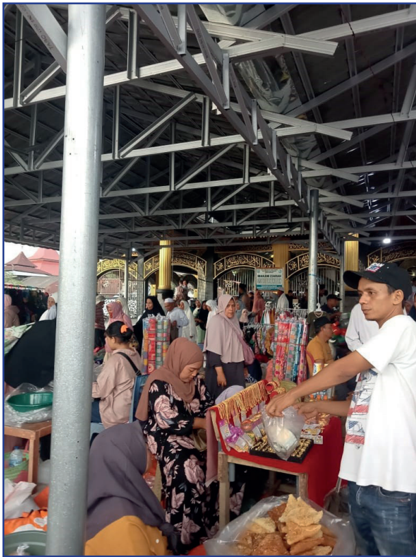
Figure 7: Merchants Outside the Cemetery Area