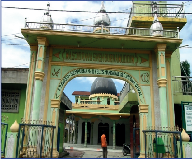
Figure 3: Mosque of the Shaykh Burhanuddin in Medan