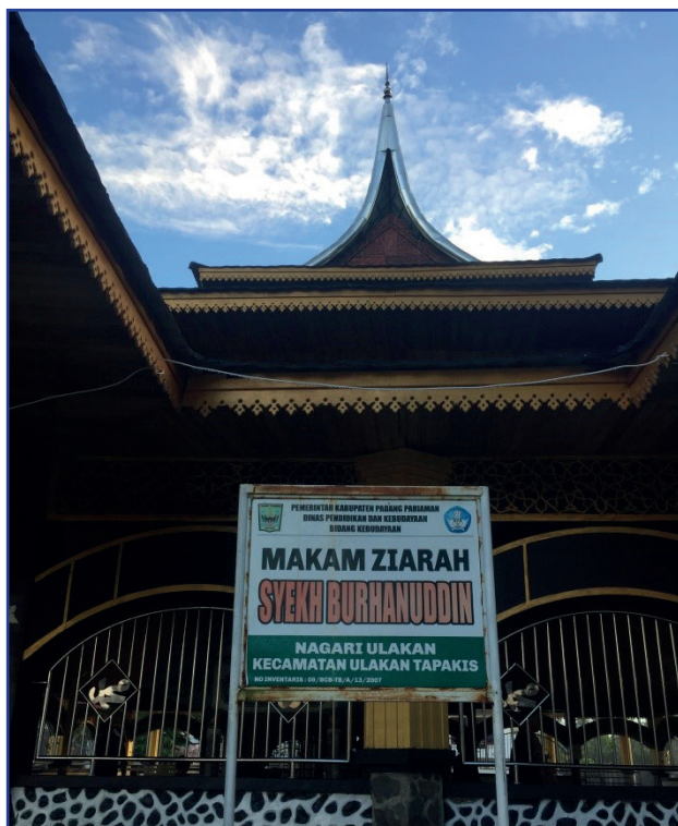
Figure 1: Front of the Grave of Shaykh Burhanuddin Ulakan