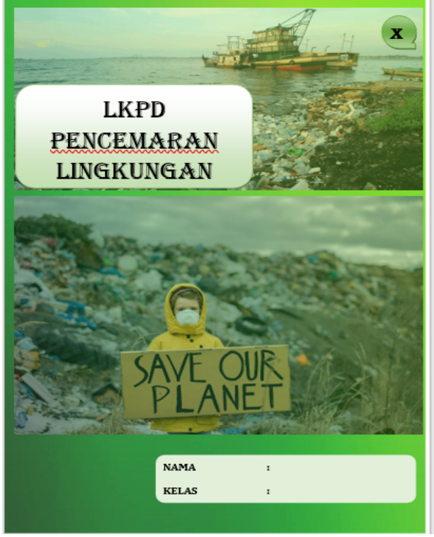
Figure 1. Student Worksheet Cover

In terms of content, there are several pictures of environmental pollution in the Student Worksheet based on discovery learning, material pollution, water pollution, soil and air pollution. The third aspect is testing by media expert verifier experts and the purpose of the material is to determine the accuracy of the production of student notebooks and research tools made. This is based on the opinion given. Research. (Rahman, 2017). The validation results are used as a reference for suggestions to improve the Student Worksheet based on discovery learning. Input and validation input are used as a reference for product improvement to produce a good product. The results of the media and material expert verification can be reviewed in Table 1.