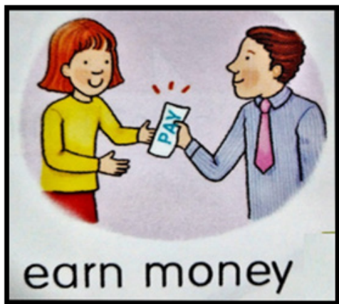
Figure 3: Male and female characters in a professional context

The data in Figure 3 shows stereotyped portrayals of males and females in the working sphere as found in the national ELT. The picture portrays the interaction of a woman and a man in a workplace as a sociocultural space. In this situation, the woman is receiving some money, probably her wage from the man because there is the word 'pay' written on the paper handed over. Since the woman's hands are pictured in a lower position than the man's, it could be further assumed that the female character works as an employee and the man plays the role of an employer. This assumption can also be strengthened by the analysis based on the perspective of the outfits worn by the two characters. It could be presumed that the man holds a higher professional position compared to the woman since he dresses more formally which can be observed from the presence of a tie as part of his apparel.