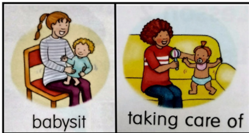
Figure 1: Two female characters doing childrearing activities

A closer look at the data reveals detailed information regarding the babies' ages and the parenting behaviour the two women demonstrate. In the first picture (on the left), the woman is holding the baby, placing her on her left leg with her hands around her body. From the way the woman places her left hand around her waist and the right hand on her tummy, she is trying to support her sitting position to prevent a possible fall. As shown by typical baby milestones that a baby nearing the independent sitting stage ages from seven to nine months (Dewar 2019), it could be hypothesized that the baby in the picture is one year old or younger and the activity is likely to be done regularly as the mother helps her baby practice to sit independently.