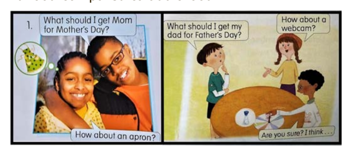
Figure 7: The stereotypical depiction of females engaging in leisure activities in English Chest 6 (pp.64, 69)

Common stereotypes hold that males and females spend different amounts of time on leisure activities. Males are thought to be more inclined to 'thing-oriented' activities such as vehicle repair, carpentry, engineering, whereas females are more drawn to 'people-oriented' activities such as dancing, acting, and shopping (Lippa, 2010). The findings related to this topic discloses that the highest frequency of male and female representation in both local and international ELTs is depicted doing leisure activities (91 and 207 times, respectively). Both ELTs depict females and males in a much wider range of settings which include participating in different kinds of indoor and outdoor sports, shopping, reading, playing music, etc. Furthermore, as shown in Tables 3 and 4, it is also found that the local ELT depicts a fairer distribution of males and females in this social context, while interestingly the international one portrays females engaging in leisure activities more often than their male counterparts. A closer examination to the figures in those two tables reveals that both genders are visualized more often as children when doing leisure activities with a ratio of 6: 1 in English Chest 6 and 1.6:1 in Let's Go 6 . These findings give the impression that spare time is more affordable during childhood compared to adulthood.