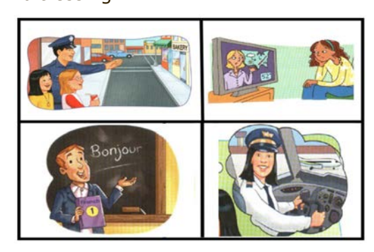
Figure 6: Some examples of gender portrayals in professional setting in Let's Go 6 (pp. 1, 28, 46, 47)

Interestingly, in contrary to the stereotyping portrayal of teaching profession in the local ELT, this textbook depicts a teacher as a gender-shared occupational role played by both female and male characters. This finding points out that this ELT attempts to evoke a 'gender equality discourse' (Barton & Sakwa, 2012), emphasizing the notion that women and men are equally able to operate in the same traditional nurturing professions such as teaching and waitressing.