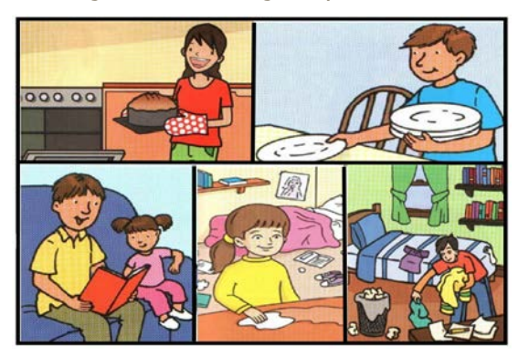
Figure 3: Some examples of gender portrayals in familial setting in Let's Go 6 (2012, pp. 27, 45, 48, 49, 53)

Contrary to the findings of the local ELT with a stronger tendency to depict women in domestic roles, Let's Go 6 depicts a fairer distribution of both genders doing similar range of activities in familial setting. Even in absolute numbers, the genders are portrayed quantitatively equal with a ratio of 1:1 (see Table 4). Figure 3 shows equal involvement in household chores by females and males. Three out five pictures in Fig. 3 also note some departures from the traditional gender stereotypes in which males are portrayed as setting the table, cleaning the room, and performing a childrearing duty, in this case reading the daughter a story book.