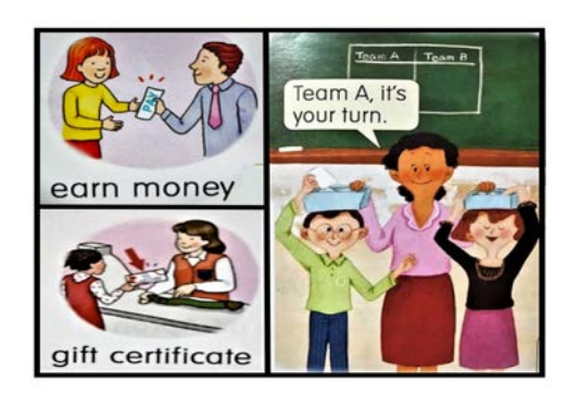
Figure 5: Some examples of gender portrayals in professional setting in English Chest 6 (2006, pp. 23, 64, 70)

A closer examination of the book also reveals some hidden gender inequities that deserve attention. When females are depicted in the work sphere, they tend to be positioned as a subordinate instead of a superior or a coordinate. The picture in the top-left in Figure 5 portrays the interaction of a woman and a man in a workplace as a sociocultural space. The woman in this situation receives some money, most likely her wage, as the word "pay" is written on the paper handed to her. It's reasonable to presume that the woman is an employee and the man is an employer. Similar to this assumption, based on the clothing worn by the two characters, it may be assumed that the man has a better professional position than the woman because he dresses more formally, as evidenced by the inclusion of a tie as part of his attire. This illustration ratifies female inferiority in occupational domain.