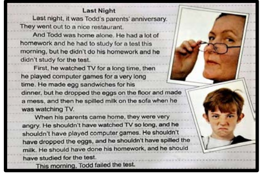
Figure 2: The depiction of a stereotypical behavior of a mother in English Chest 6 (2012, p.79)

Another stereotyped visualization of females in English Chest 6 can also be seen in Figure 2 depicting the portrayal of a woman with a familial role as a mother. In this socio-cultural situation, the mother seems to be angry with her son for his misbehavior. The stereotypical portrayal of an adult female as a mother becomes evident when we carefully inspect the text stating "when his parents came home, they were very angry" (para. 3, Lines 1-2). In this sense, Todd is acknowledged to have more than one parent, possibly a father and a mother. However, the image only shows a female parent/mother, rather than either both parents or the male one/father, rolling her eyes in exasperation signaling her anger at her son's disobedience. The image may reinforce the depiction of a stereotypical behavior a mother should regulate as a primary caregiver and children's first educator (Cordry & Wilson, 2004). In this respect, she is expected to be the rule maker regarding her children's activities and enforce it to teach them discipline and time management.