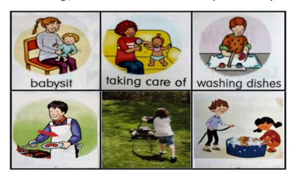
Figure 1: Some examples of gender portrayals in familial settings in English Chest 6 (2012, pp.20, 38, 64, 70)

As seen in Table 3, there is strong female presence which is proven through the higher frequency of female characters than their male counterparts with the ratio of 4: 1. Females are also portrayed to be engaged in a wider range of activities than males (15 vs. 4 types respectively). Specifically, as seen in Figure 1, females are visualized to play a traditionally feminine role, such as performing nurturing duties and doing domestic chores in the kitchen, which are dominantly visualized with adult females (women) as the main characters. On the other hand, males are only depicted to be involved in familial activities in outdoor settings such as barbecuing, pet caring, and lawn mowing, which are dominantly done by male children (boys).