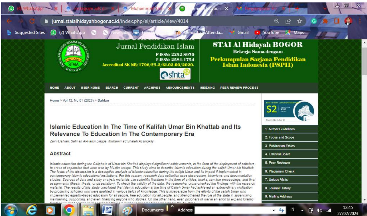
Gambar 6. Artikel Publish secara Online di OJS.