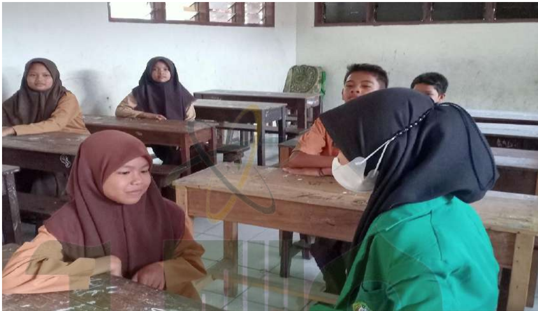
Interview with the students

UNIVERSITAS ISLAM NEGERI SUMATERA UTARA MEDAN