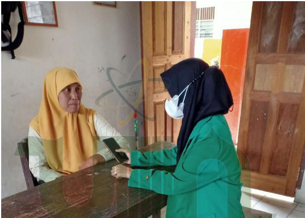
Interview with English teacher

UNIVERSITAS ISLAM NEGERI SUMATERA UTARA MEDAN