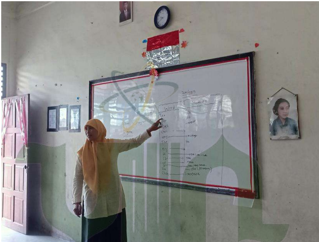
The teacher re-explains the material that has studied SUMATERA UTARA MEDAN