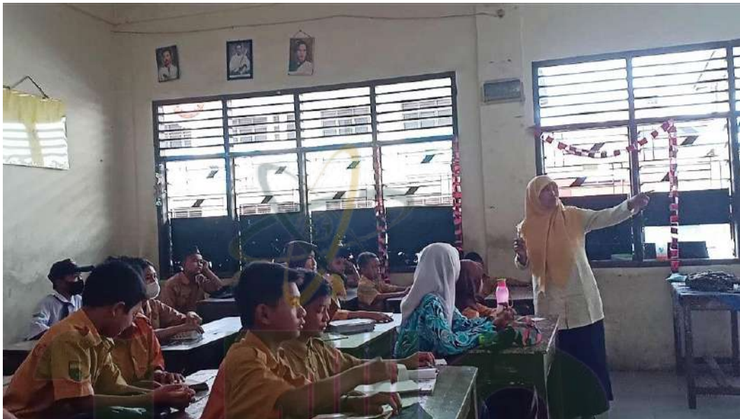
The teacher asks what words the students doesn't know