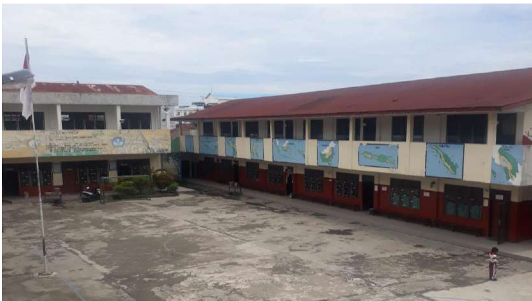
School field at SMP Pahlawan Nasional Medan