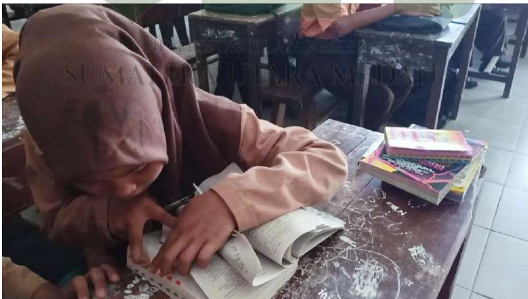
The students look up the meaning of new words in the dictionary