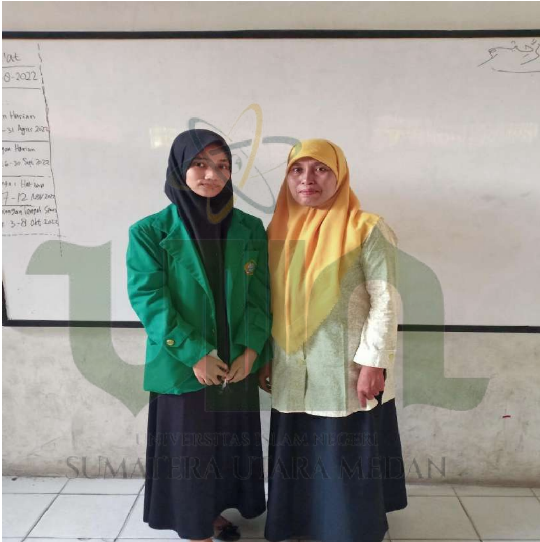
The researcher with English teacher