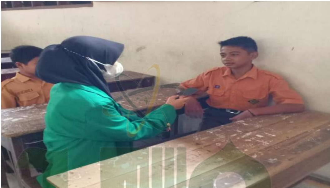
Interview with the students