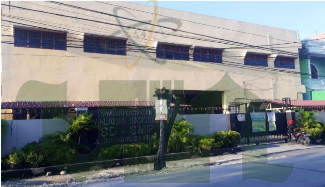
The front yard of the school at SMP Pahlawan Nasional Medan