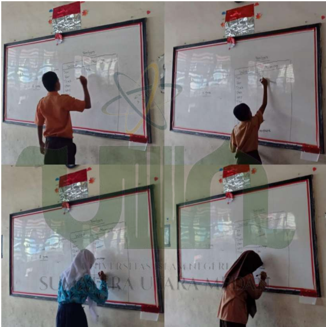
The students excited to write down the new words