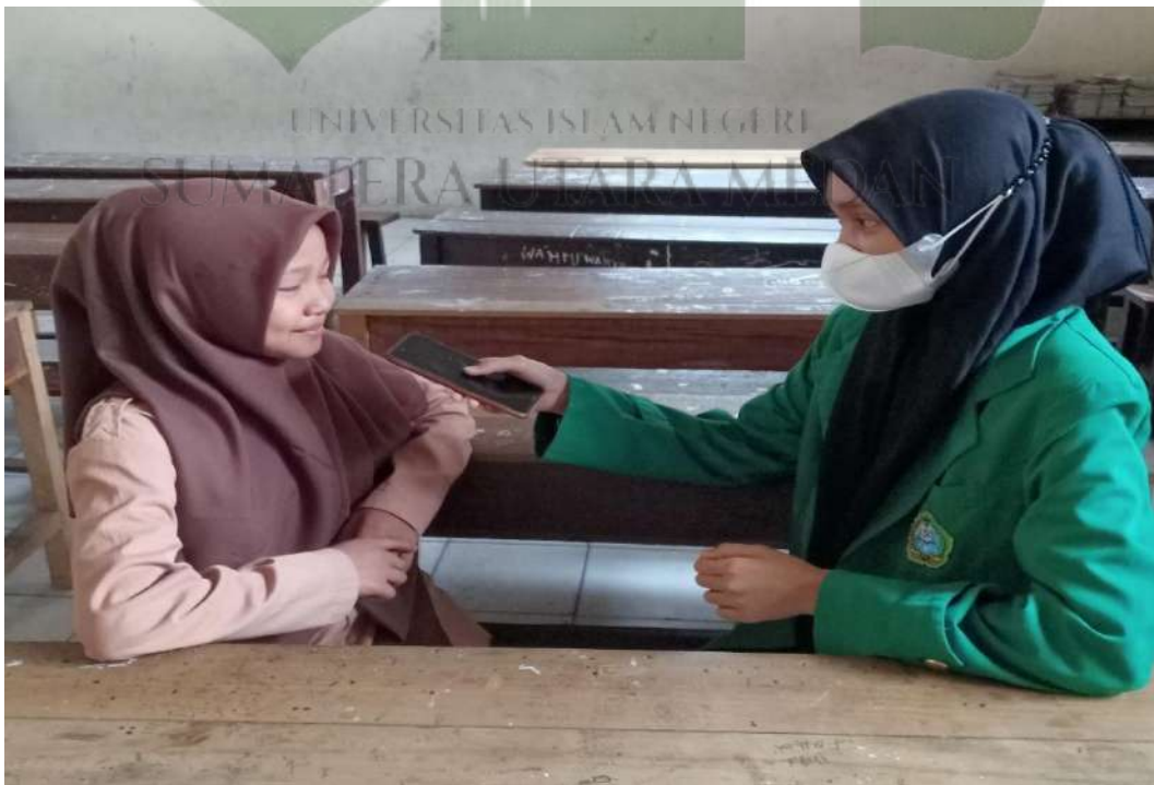
Interview with the students