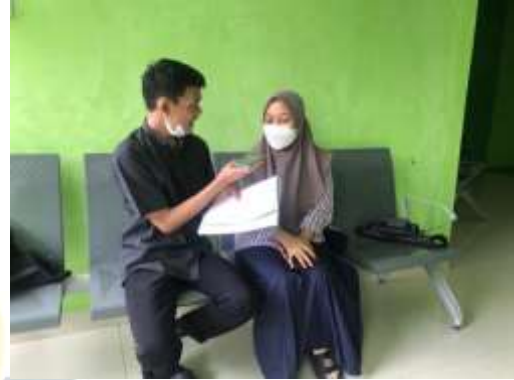
Interview April 7, 2022 at 09:30–11:00 WIB