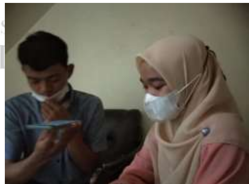
Interview April 13, 2022 at 10:00-11:00 WIB