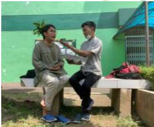
Interview April 11, 2022 at 10:30-11:00 WIB