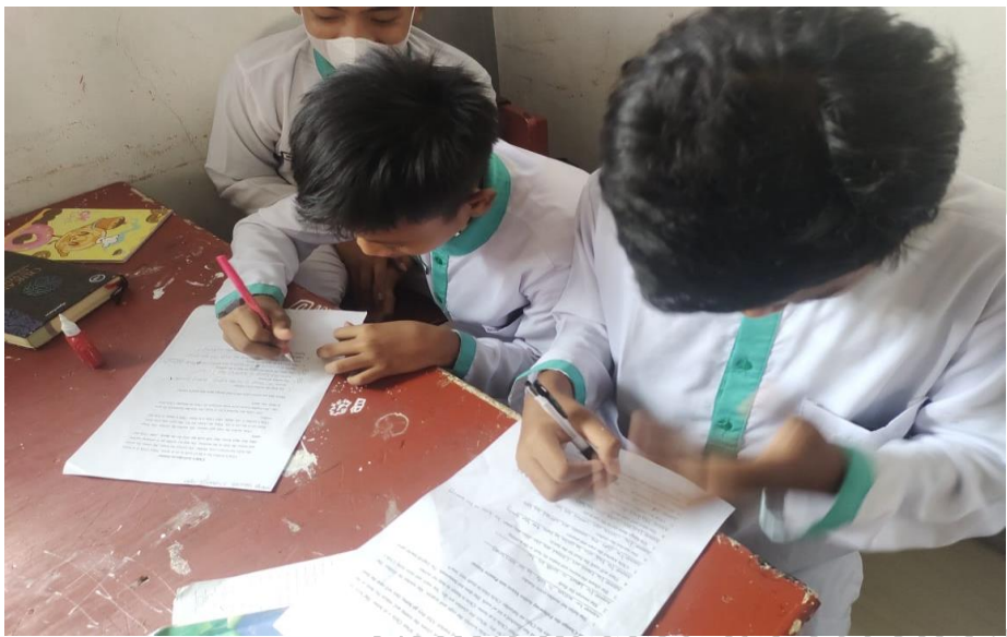
The Supporting Informant 2 and 3

UNIVERSITAS ISLAM NEGERI SUMATERA UTARA MEDAN