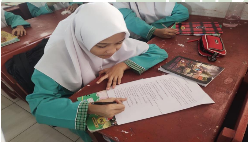
Photos when the students transformed active voices into passive voices