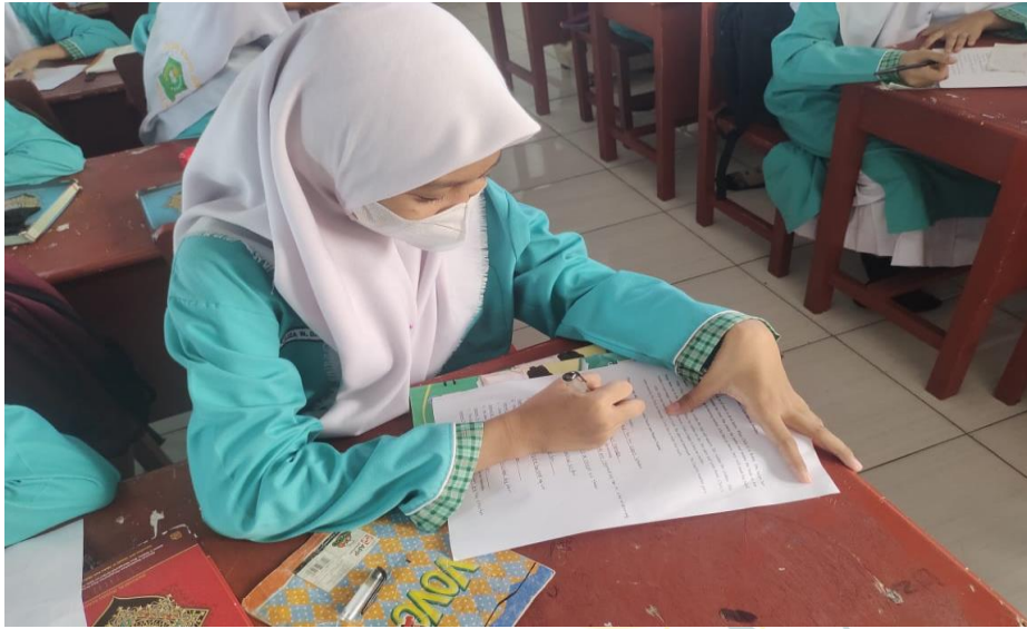
The Supporting Informant 1