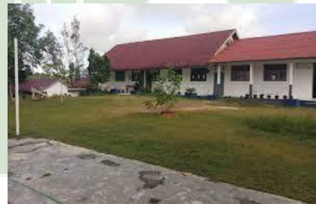
SMA Negeri 8 Padangsidempuan