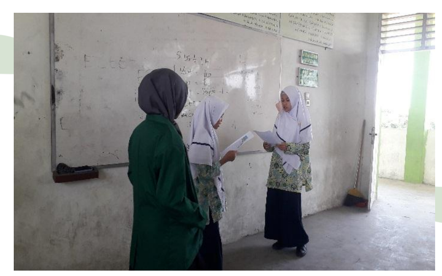
SUMATERA UTARA MEDAN