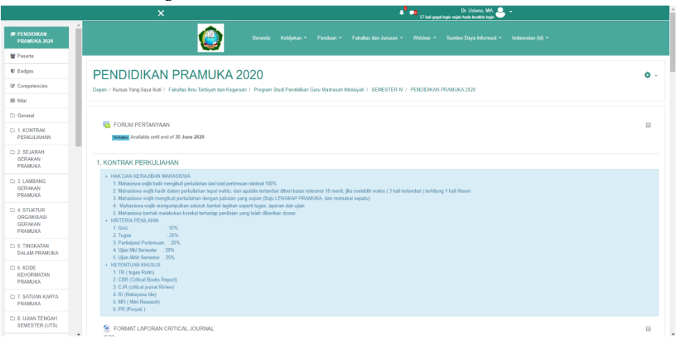
Figure 1. Front page of E-learning UIN North Sumatra.

The following is displayed in the form of the front page of UIN North Sumatra UIN in Figure 1 below.