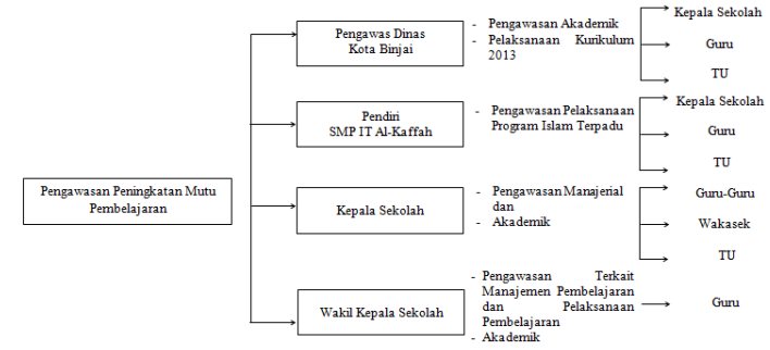
Figure 3. Concept Map of Learning Quality Improvement Supervision

Furthermore, the concept map of supervision to improve the quality of learning at SMP IT Al Kaffah Binjai is shown in Figure 3.