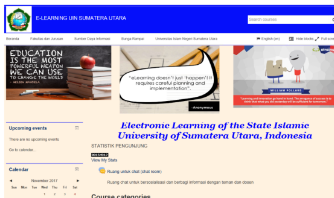
Figure 1: Main Interface of E-learning UINSU

The e-learning of UINSU is available and can be accessed at http://elearningiainsu.com . The system was built using a Moodle version 2.6. This system enable students a lot of activities relating to their academic tasks. Below is the interface of e-learning of UIN Sumatera Utara.